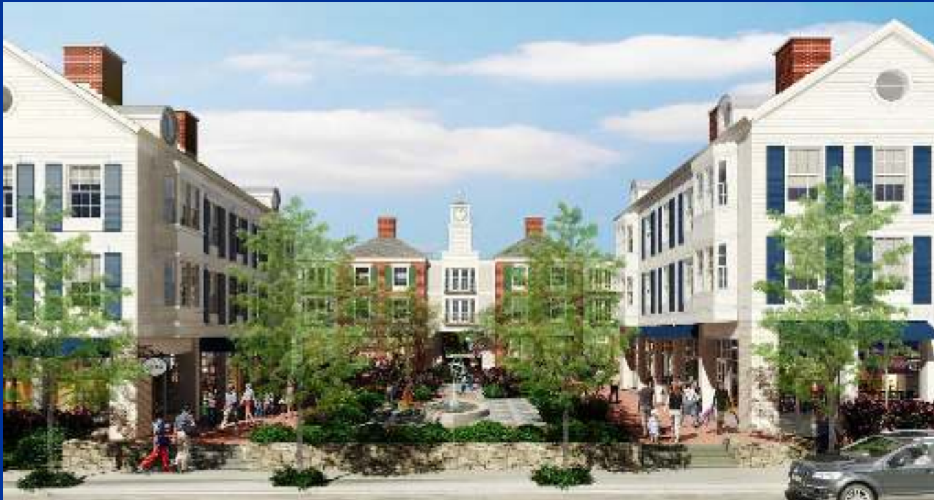
Proposed finished product